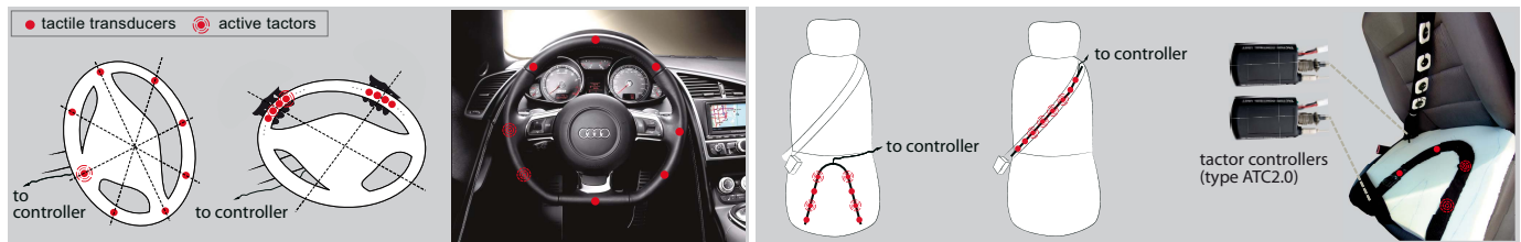
Fig. 2. Different styles of vibrotactile displays (left: eight tactors embedded into the face of the steering wheel, much more tactors can be integrated into the backside; right: eight tactors in both safety belt and seating).

To test on the effect of subliminal support a multi-tactor system was integrated into different controls of our test vehicle (driver seat, safety belt, and steering wheel). Positive experience in the utilization of vibrotactile interfaces has been gained in earlier experiments on conscious driver stimulation with tactile patterns of different complexity.