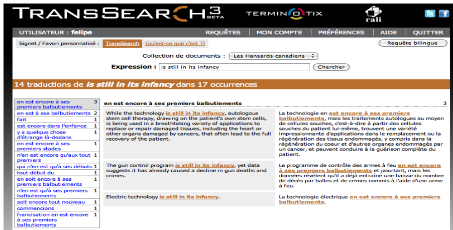
Fig. 1. Result returned by the new TRANSSEARCH to the query “ is still in its infancy ”. The left column shows likely translations in decreasing order of likelihood, while the main columns shows concordances. The query and the selected translation are shown in color in each of them.

results for the query “ is still in its infancy ” exemplifies the new capabilities of the system. Where a simple bilingual concordancer (as were the previous versions of TRANSSEARCH) would only display a list of parallel sentences containing the query in their English part, the new version of TRANSSEARCH highlights for each sentence pair the French part associated with the query. Besides, this version displays on the left hand side the whole range of translations (automatically) found in the TM. For the first suggested translation, “ en est encore à ses premiers balbutiements ”, three of the sentence pairs containing a variant of this translation (see the merging process described in Section 2.2) are displayed in context.