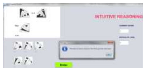
Figure 3 Example of a series of intuitive reasoning game

This game has three levels of difficulty (varying according a time constraint: unlimited, 1mn and 30s) and 15 series in total; where every level contains 5 series of exercises. Unlike other games, this game is based on the intuitive or analogical reasoning (see figure3).