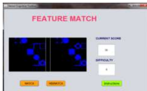
Figure 1 Example of Feature Match for level 6

This game consists in identifying whether the two images appeared on the screen are identical or not according to their forms, numbers and colors. It has also six difficulty levels (ranging from L1 to L6) which vary in its geometrical number and forms (see figure 1).