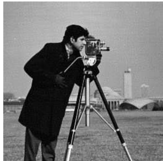
FIG. 2 – From top to bottom : Noisy-blurred image Exp2 (see Table 1) and restored image using the proposed approach (ISNR=7.23 dB) (see Table 2).