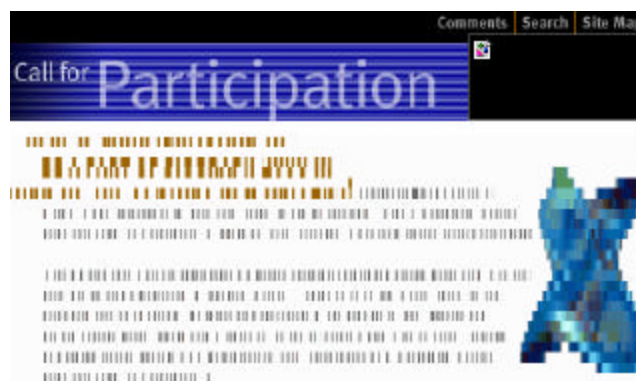
Fig 1 We are so accustomed to see such a web page that sometimes we don't even notice that something is wrong with it.

What is the optimal representation for network-based imaging? At first glance, the answer seems obvious: the representation that provides the best visual quality for a given volume of information. But what is the reality of network-based imaging? During peak hours, a typical web page like that in Fig 1 may appear for long seconds while loading before it switches to normal resolution. A logical argument behind this obviously insufficient representation is the following: it's better than nothing, patience, in a short instant the image will be better. The problem is that very often the viewer has no patience to wait for this better image and will skip the page, thereby missing some essential information. A typical user connected to the network via a modem line faces the dilemma between