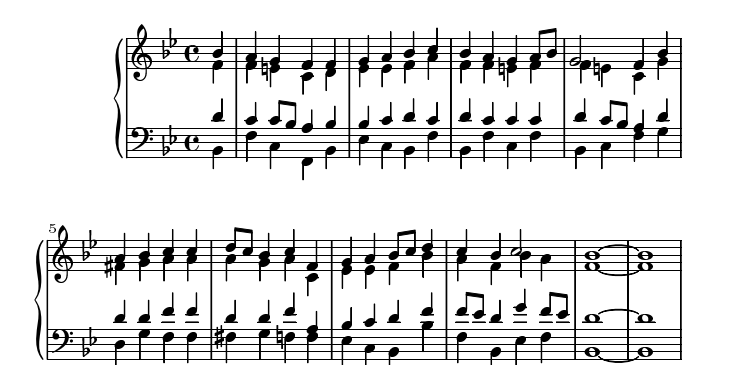
Figure 2: Most likely harmonisation under our model of chorale K4, BWV 48