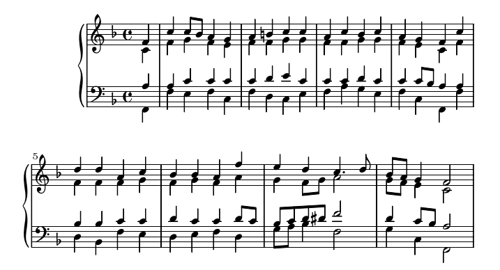
Figure 3: Most likely harmonisation under our model of chorale K389, BWV 438